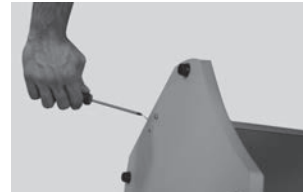
Fix the base plate to the rectangular panel using screws provided