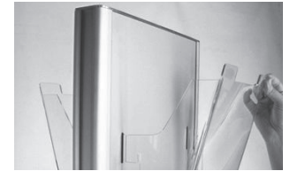
Insert the brochure holders on the rectangular panel