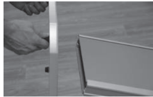
Line up the base plate holes to the main body part