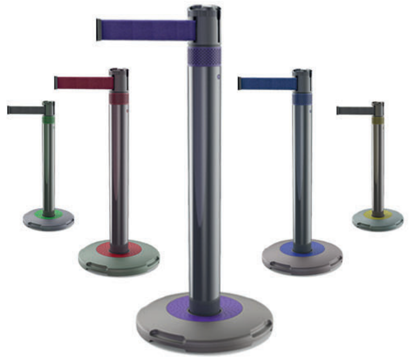
Includes 3 metres of coloured webbing.

The Q system has so many modular options available it can be tailored to create colour combinations that really brings the barrier system to life.