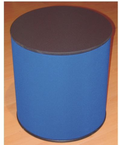
Finally fit the the remainder of the wrap to complete the unit