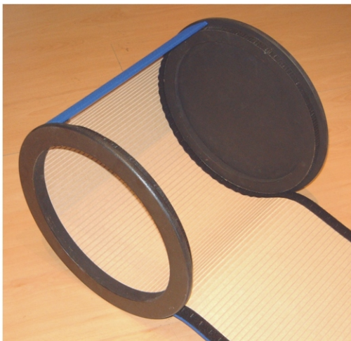
Fit the top to the wrap