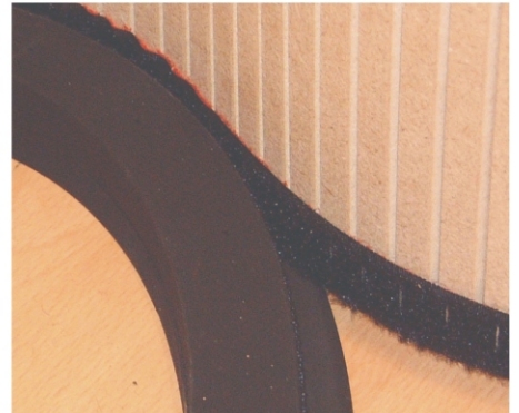
Ensure the hook fastener is fitted securely around the lip of the base and the top