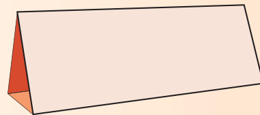
Large 260cm x 100cm