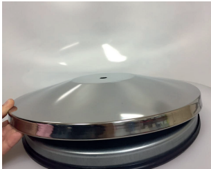
Position the base cover on heavy duty base plate