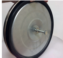
Affix screw through the bottom of heavy duty base plate