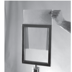
Slide your printed graphic within framework and push fit complete unit onto top of post to secure