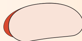
Medium 200cm x 100cm